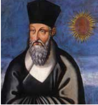
Father Matteo Ricci (1552 - 1610), humanities student in Macerata, introduced philosophy and Christian studies in China and was the first Westerner to be invited into the Forbidden City.

As a cross-cutting issue of broad relevance, Social Sciences and Humanities research should be strictly involved in addressing the multi-faceted challenges posed by the modern world. Integrating the Social, Economic and Human Sciences dimension in a silos-free dialogue into research and new technologies means they can make their contribution just where they are most needed: in maximising the societal returns from investment in science and technology, and in helping find solutions that are relevant and valuable for people's lives.